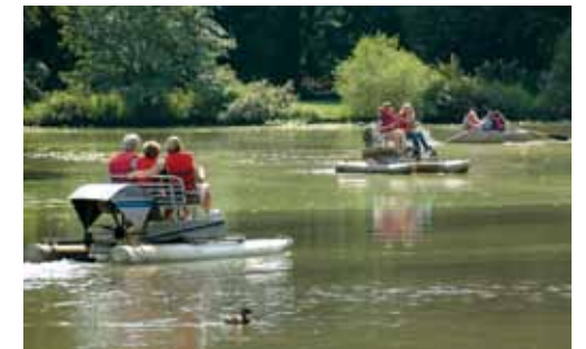
Paddleboats on the lake