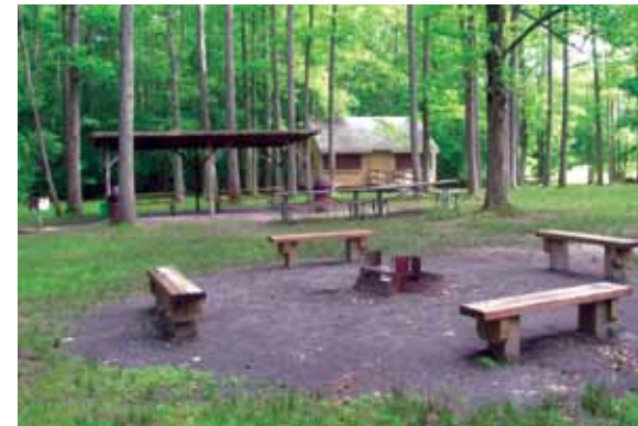
Grill area, shelter and cabin at Deerfield

Please make checks payable to “Monmouth County Board of Recreation Commissioners.” Fees and charges directly support your park system. A full refund for cancellations will be granted only if Turkey Swamp Park is given 48 hours notice prior to date of reservation.