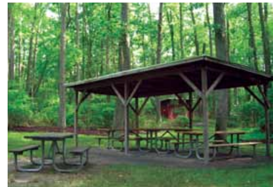
Picnic shelter at Fox Den