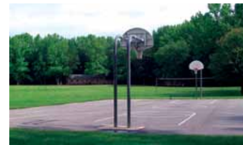
Nomoco's basketball/volleyball court